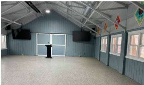
Watchu Center at Camp Wheeler

Visit Winnebago Scout Reservation and enjoy its many campsites, cabins, Corwin Training Center, or the Cub Family Camping Area.