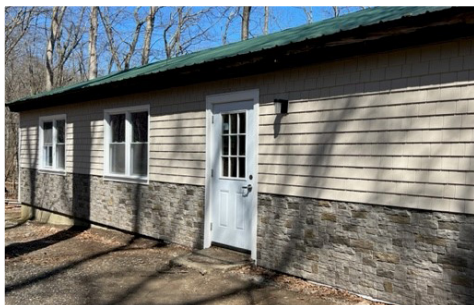
OA Lodge at Mt. Allamuchy Scout Reservation