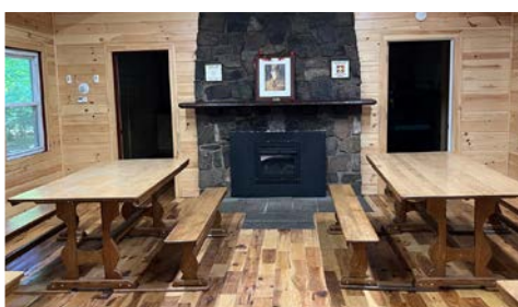
Winter Lodge at Winnebago Scout Reservation